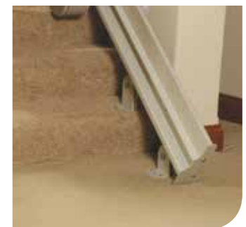
Powder-coated champagne painted rail.